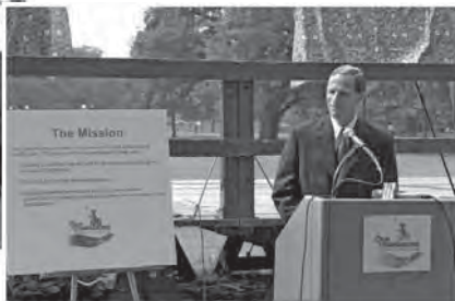
Photos from Our Companions Formal Announcement at Bushnell Park in 2004.