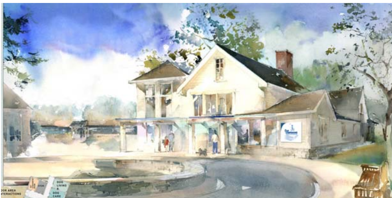
Our Companions Domestic Animal Sanctuary future animal adoption and rescue center