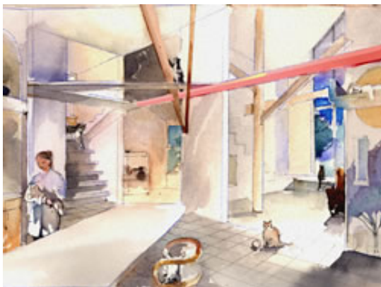
Cat House Interior